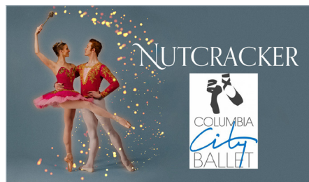
The Columbia City Ballet will present the beloved Nutcracker on Nov. 29 at 7:30 p.m.