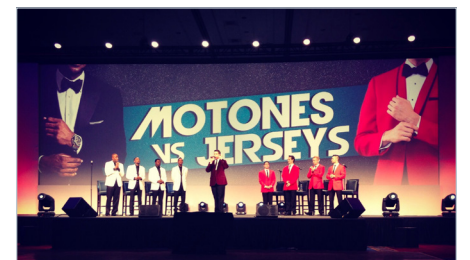
Who will reign supreme in this performance of the Motones & Jerseys on April 4 at 7:30 p.m.?