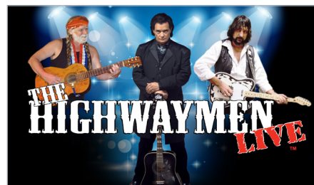
The Highway Men Live will pay tribute to three country music legends on Feb. 16 at 7:30 p.m.