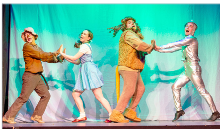
"The Wizard of Oz" musical will come to life on the stage of the Cole on Nov. 5 at 2 and 5 p.m.

TICKETS: (910) 410-1691 RICHMONDCC.EDU/SHOWTICKETS